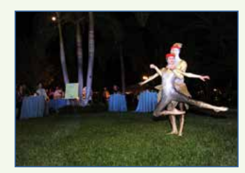
SAVE THE DATE: NOVEMBER 8, 2018