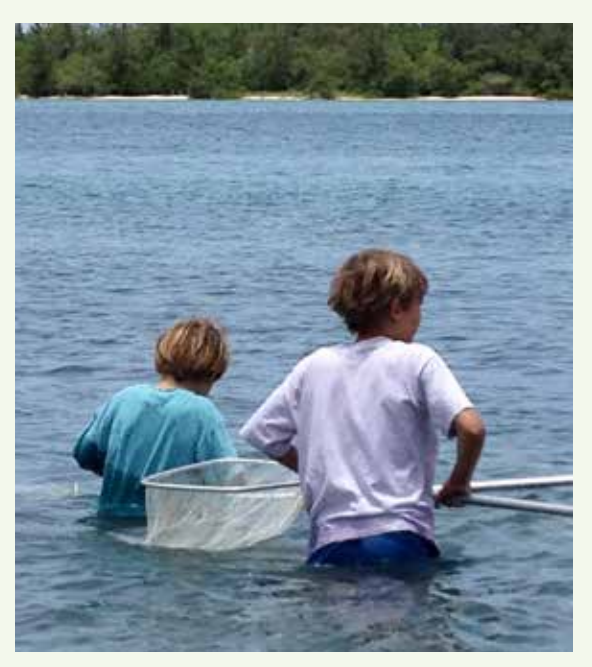
Monitoring fish populations

The Land Trust, in acquiring more than 925 acres along the Indian River Lagoon over the last five years, has protected critical coastal wetlands and pristine oak hammocks from residential and commercial development. IRLT also created a unique opportunity to help protect the Lagoon by studying and caring for these important lands in relation to this diverse estuary. That's why the Land Trust is completing management plans for twelve blocks of conservation areas, ranging in size from 4 acres to 190 acres. The management plans will be finished this winter, allowing the Board and staff to identify and prioritize scientific-based restoration projects that will help to reestablish important fish and bird populations and improve the water quality along the Lagoon.