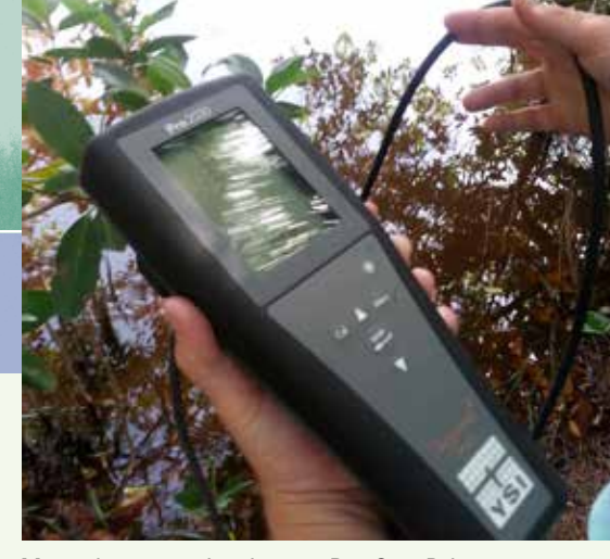
Measuring water chemistry on Bee Gum Point