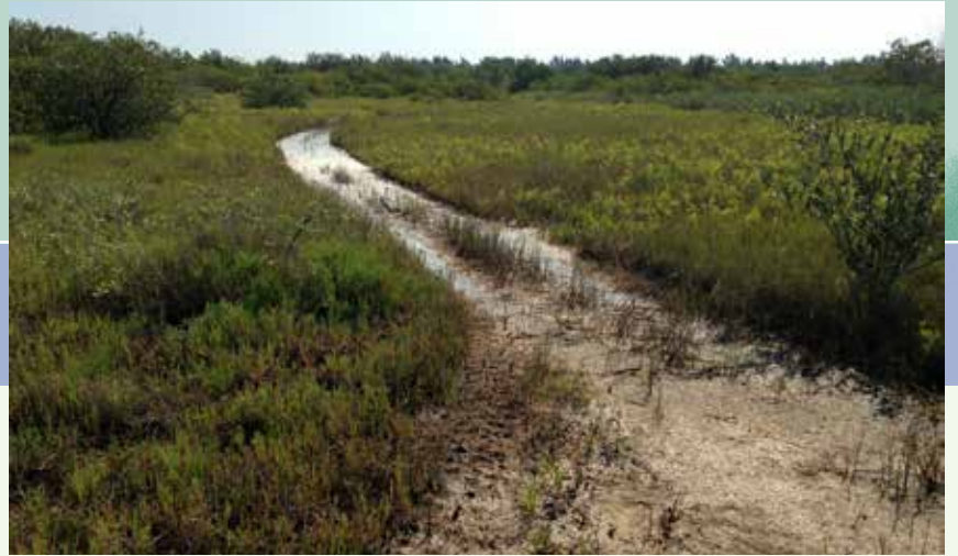
Narrows Marsh part of the Bridge View Property