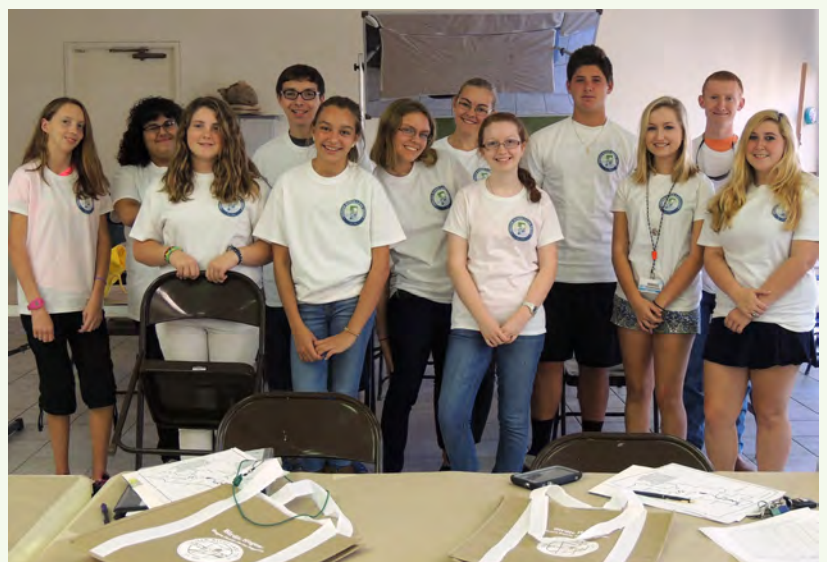
ArtLAB students in their Land Trust t-shirts.