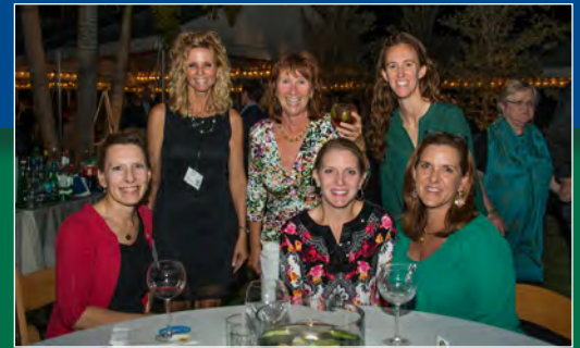
Volunteers at the annual benefit