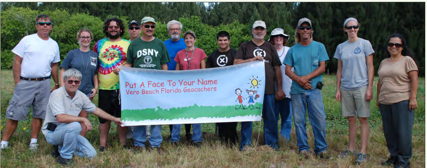
Volunteers from the Vero Beach Geocachers joined Land Trust staff for a workday at the Lagoon Greenway in November to spread mulch on trails, install new mile-marker trail signs, and clean up trash caught in the mangroves.

To volunteer call our office — 772.794.0701.