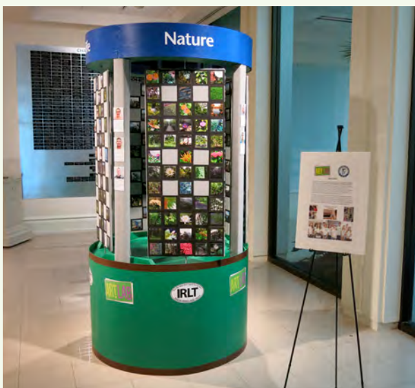
ArtLAB kiosk constructed by students to display photography on view at the Vero Beach Museum of Art.

The students were invited to visit and take pictures at Land Trust properties, and upon completion of the semester all photos from the display will be sent to Tallahassee along with student letters to legislators expressing concerns about lagoon deterioration.