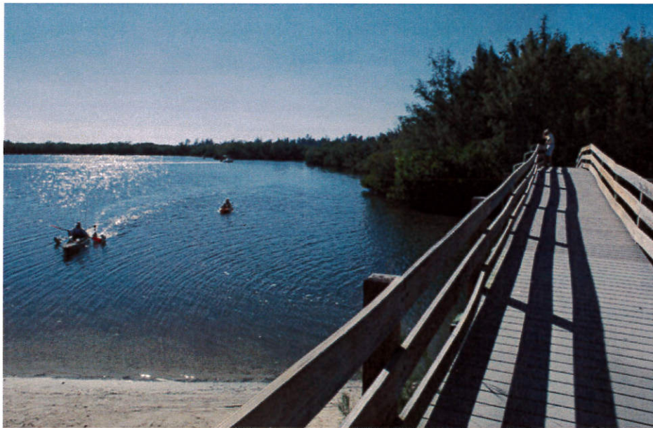
Kayakers enjoy the Indian River Lagoon at Round Island Park in Vero Beach in 2013. The park is just south of land where the Oyster Bar Marsh Trail would be built.

By Colleen Wixon of TCPalm Yesterday 7:36 p.m.